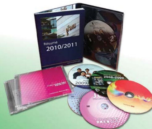
CD / DVD & Replication